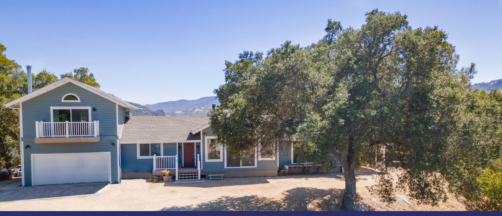
4110 Charcoal Road, Paso Robles - Offered at $685,000